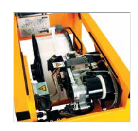
Easy to maintain and energy saving Automatic motor shut off after each cycle